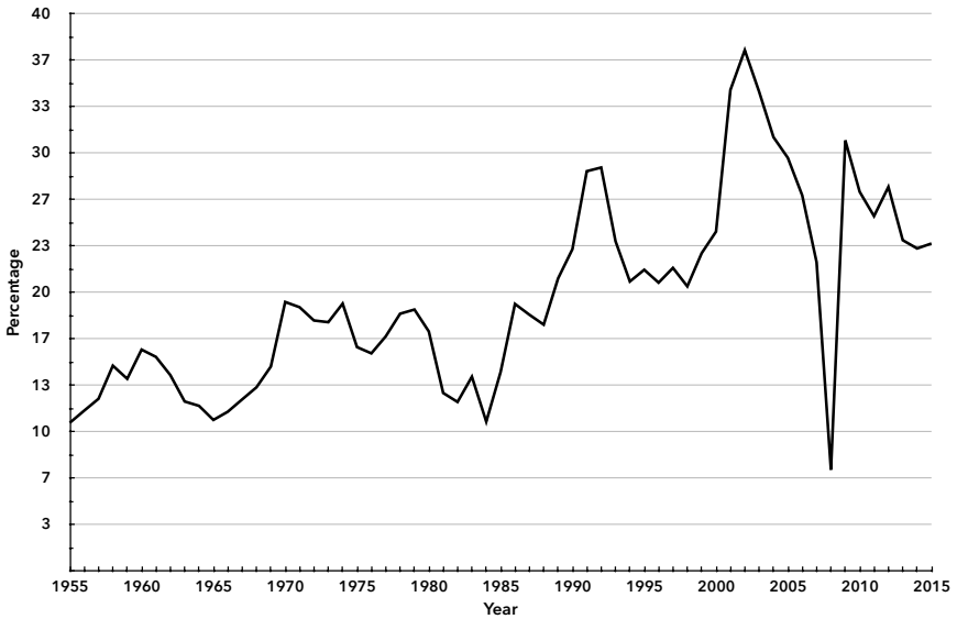
Chart 1. U.S. Financial Profits as Percentage of Corporate Profits of Domestic Industries, 1955-2015

Source: "Table 1.14. Gross Value Added of Domestic Corporate Business in Current Dollars and Gross Value Added of Nonfinancial Domestic Corporate Business in Current and Chained Dollars"; "Table 6.1. Current-Cost Net Stock of Private Fixed Assets by Industry Group and Legal Form of Organization"; "Tables 6.16A, 6.16B and 6.16C: Corporate Profits by Industry," National Income and Product Accounts (NIPA), U.S. Bureau of Economic Analysis (BEA).